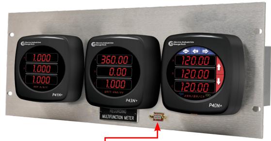
Front RS232 Port